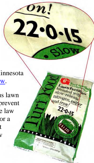
A “zero in the middle” means phosphorus-free.

The Minnesota Phosphorus Lawn Fertilizer Law regulates the use of phosphorus lawn fertilizer with the intent of reducing unnecessary phosphorus fertilizer use and preventing enrichment of rivers, lakes, and wetlands with the nutrient phosphorus. The law prohibits use of phosphorus lawn fertilizer unless new turf is being established or a soil or tissue test shows need for phosphorus fertilization. This prohibition went into effect in 2004 in the Twin Cities metro area and statewide in 2005. The law also requires fertilizer of any type to be cleaned up immediately if spread or spilled on a paved surface, such as a street or driveway.