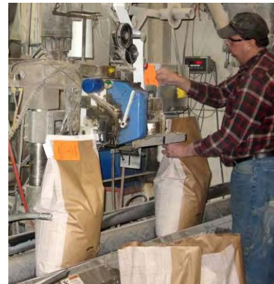
Lawn fertilizer being manufactured at Form-A-Feed, Steward, MN.

Currently Minnesota is the only state regulating the use of phosphorus fertilizer on lawns and turf. Phosphorus regulating rules or legislation is advancing in four states, Florida, Maine, Michigan, and Wisconsin, all of which have used the Minnesota law as a reference.